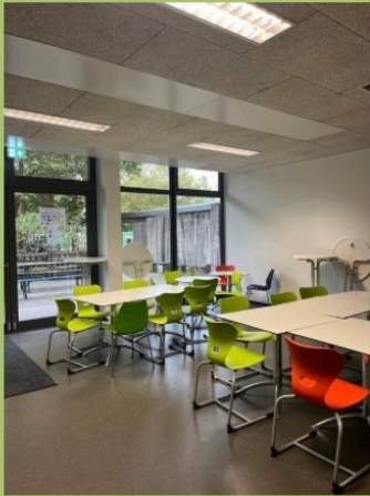
The secretaries' office to the right:

A variety of snack, drinks and sweets are offered.