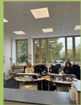
Teachers room: (first floor)

You can find your teachers there in case of sickness or and other problems