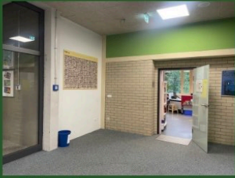
The library is on the first floor